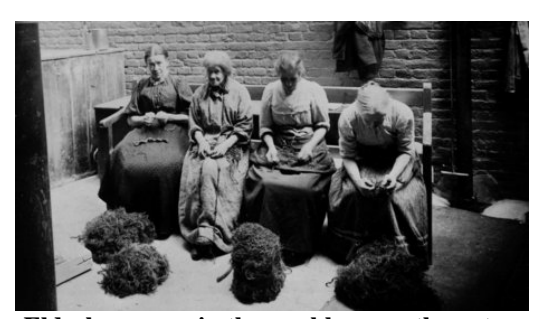
Elderly women in the workhouse – the not so good old days

In 1918 the average life expectancy of a British male was 44 and of a female 50. Today the comparable figures are 77 and 82. Forecasts predict that today's babies can expect to live to 89 and 92 respectively. This shift, we can already see, has entered Government thinking. The retirement age is about to be raised, although some would argue that the bar needs to be raised considerably more than that proposed; not by the odd year but by a full decade.